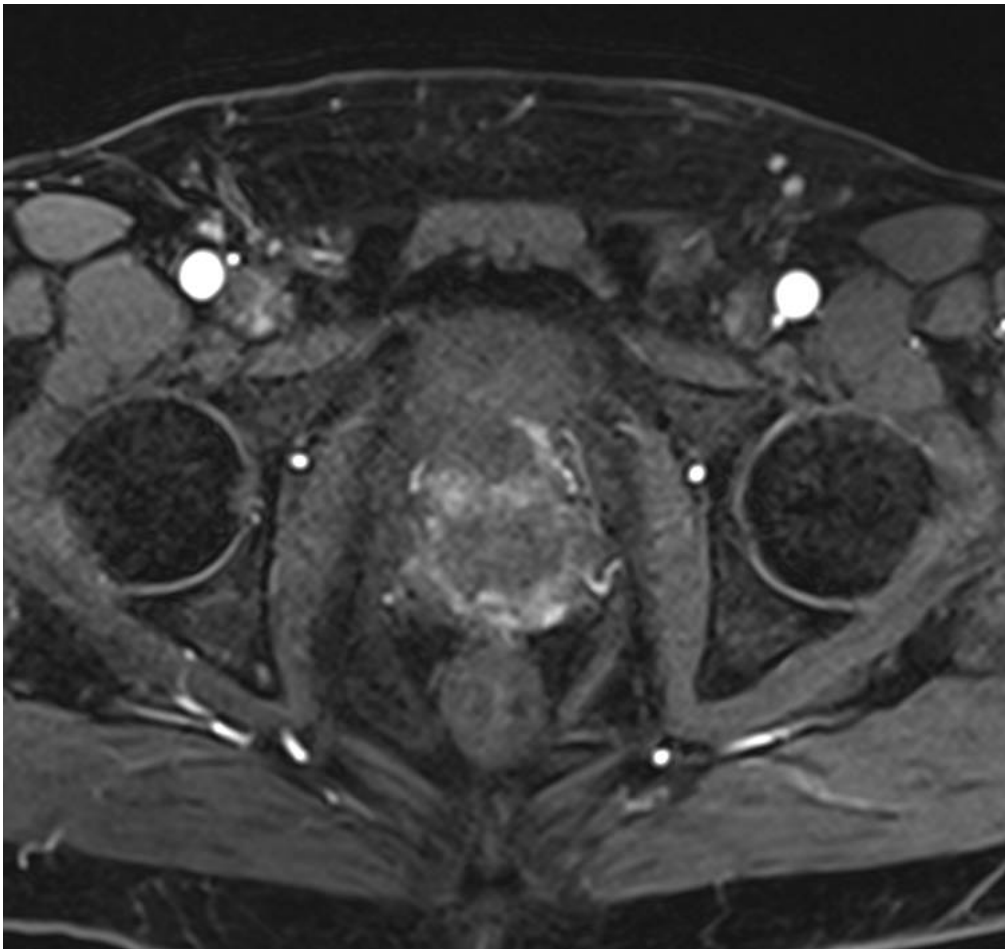
An example of a axial 3D T1 weighted, fat suppressed post gadolinium dynamic contrast enhanced image.