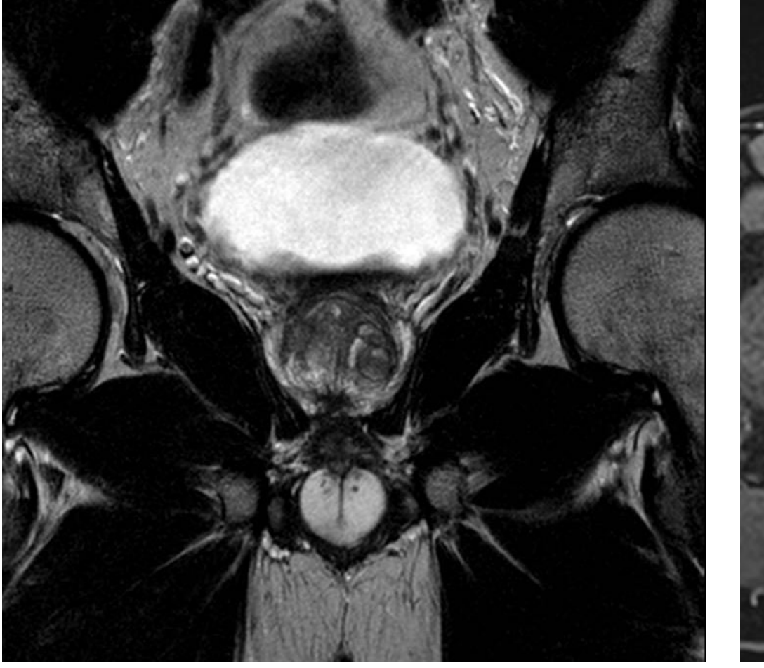
An example of a small field of view coronal T2 weighted Turbo Spin Echo (TSE) image.