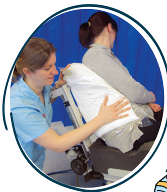
Scientist using a casting bag to take an impression of the client

If a custom contoured seat is required, it can be made from a range of materials – foam, plastic or metal links – and the process for each type is similar. Firstly, an impression of the user's desired posture in their best sitting position is captured using a casting bag and this is then scanned into a computer for manufacture.