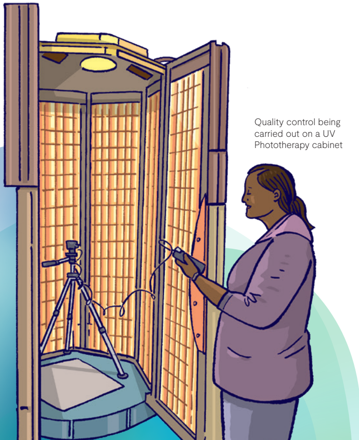
Quality control being carried out on a UV Phototherapy cabinet